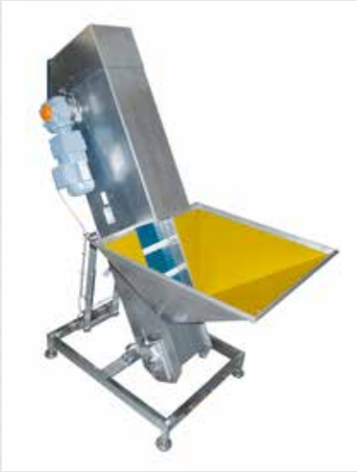
Hopper feed for small parts.