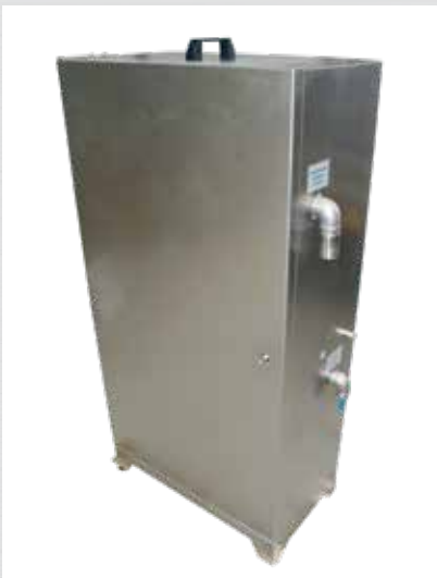
Oil separator, type: SEPP P1.