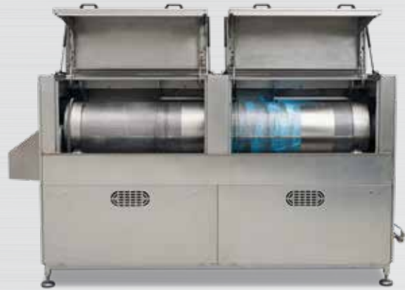
Easy access to drum.