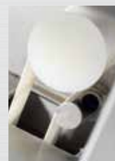
Oil skimmer - belt.

For further information about extra equipment for the different machines - please contact Cleentek. We will assist you by offering the best solution for your individual application.