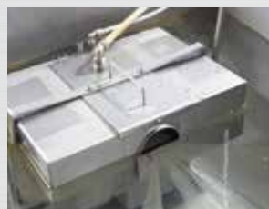
Oil separator, type: Cobra