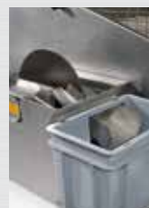
Oil skimmer - disc.