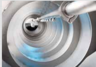
The drum, seen from the inside.

Drum Cleener™ can be fitted with optional extra equipment, so that it is customised to suit the application. Drum Cleener™ can be connected directly to the production line or robot cell, so that it is only in operation when there are items for washing.