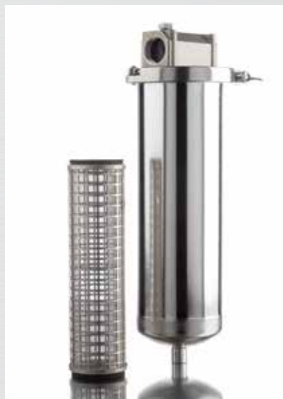
Cartridge filter 10"