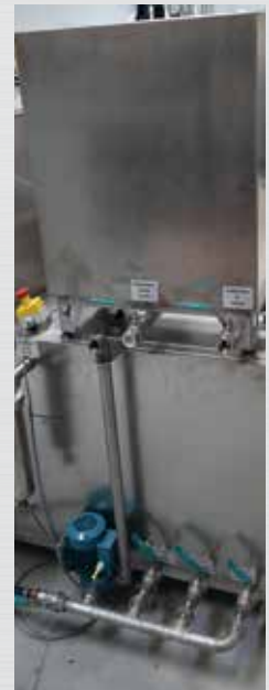
Oil separator, Type: SEPP P2 integrated.