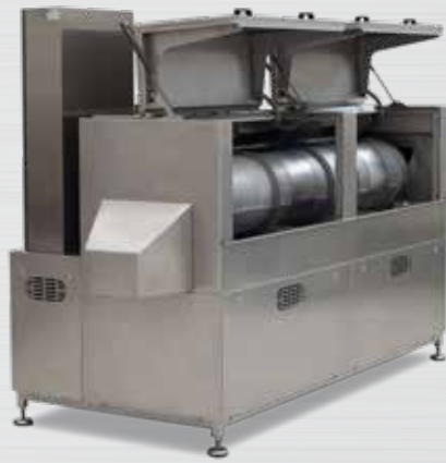
DC1040 - wash, rinse og dry.