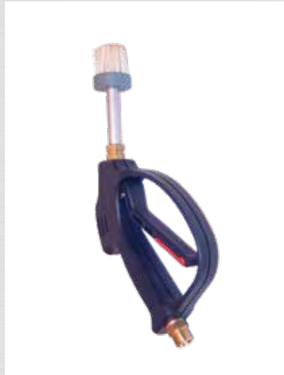
Manual washing gun.