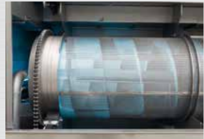
The drum rotates via chain drive.