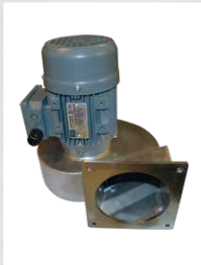
Extraction fan HL-14.