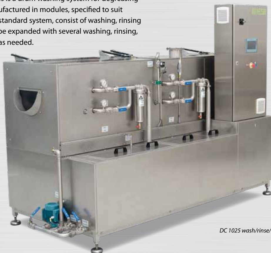
DC 1025 wash/rinse/dry.