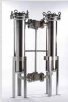
Double type 2 - pressure filter.