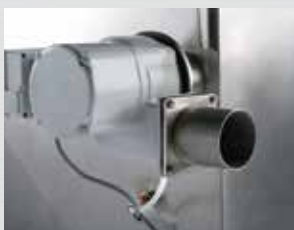
Ventilator/Extraction, stainless HL 10.