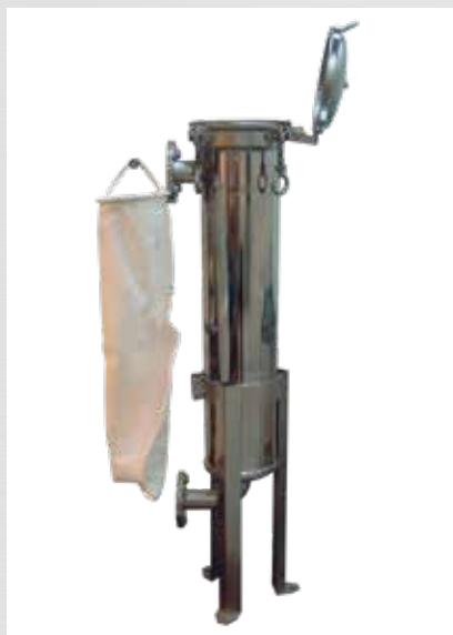
Type 2 - pressure filter

We can also provide a large selection of different cleaning solutions for use in our machines. Please contact us for advice on our various products - we will help you make the right choice.